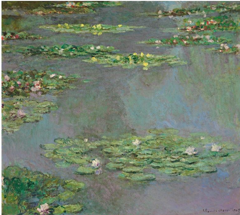
Nymphéas , 1905, by Claude Monet (1840-1926), Oil on canvas. 34¾ x 38¾ in (88.3 x 99.5 cm). Sold for US$ 43,762,500 (as on date Approximately 2,888,325,000 Indian rupees) on 7 th November 2012 at Christie's in New York

14-11-2017, Tuesday, Science and Humanities.